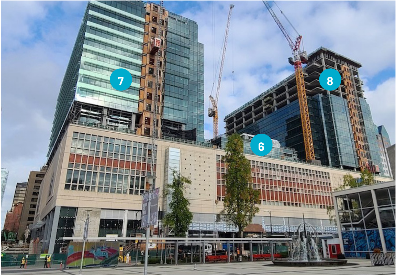
6 Outdoor atrium and sports courts area