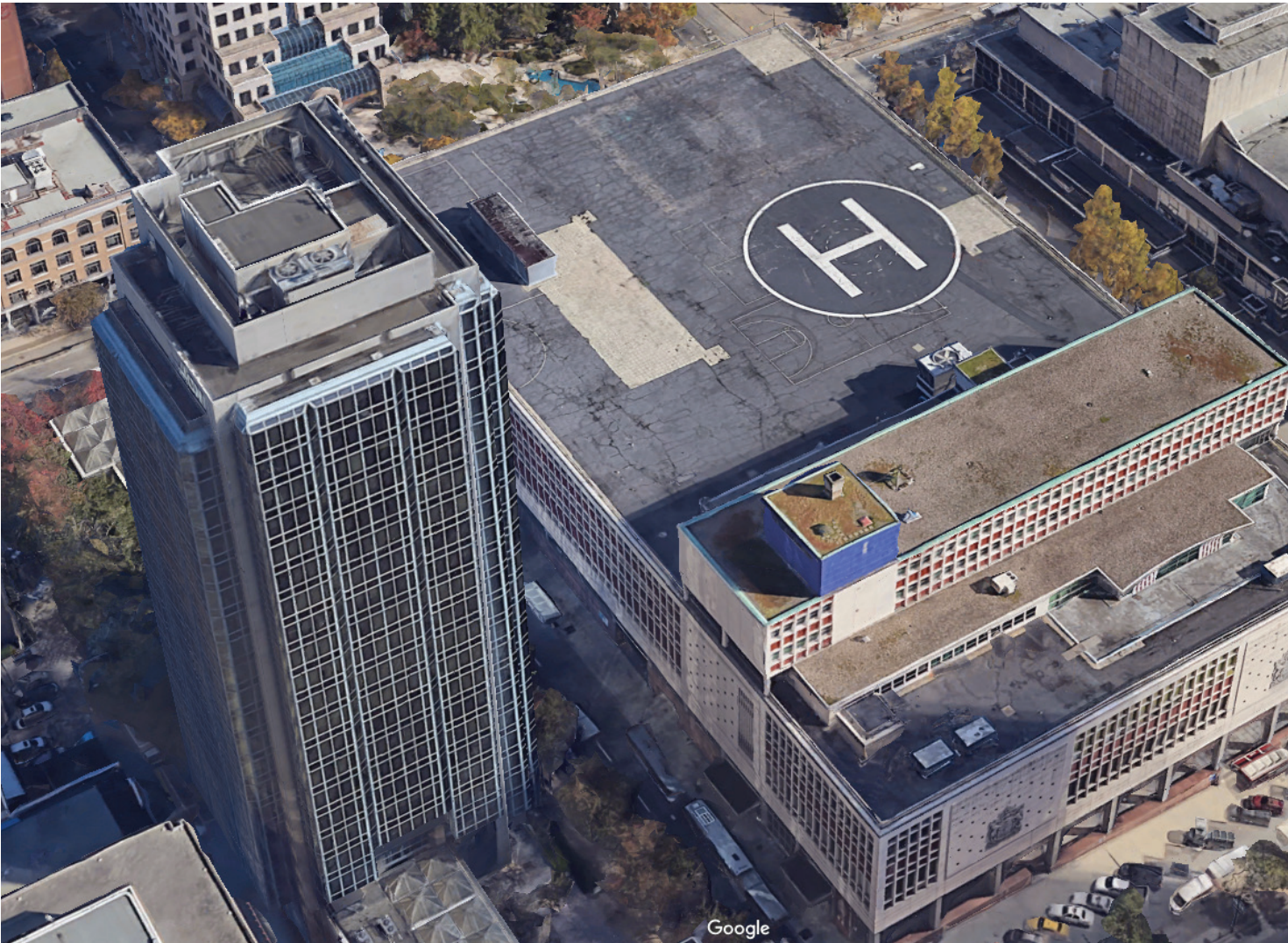
Canada Post building before construction